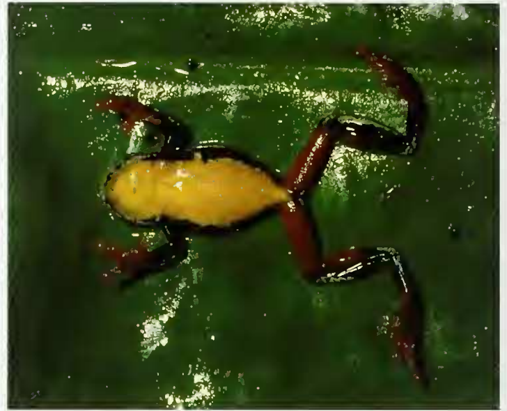
Fig. 3. Ventral view of female paratype (in PhF) of Hyperolius dintelmanni sp. nov. (ZFMK 67890).

Description of holotype: Body slender with sacrum width about one sixth of SVL; head short and broad with distance from tip of snout to posterior corner of eye about one fourth of SVL; HW about one third of SVL; snout tip in dorsal and lateral views rounded; nostril dorsolateral, protruding and visible from above; cho-